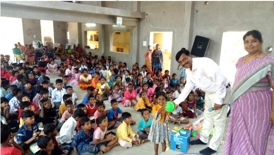
'Holiday Club' Children in the new, almost finished Church building

Please continue to pray for safety and wisdom for our church family in Akividu. Just now they are in the midst of conducting their Vacation Bible School, reaching hundreds of children from their town and surrounding villages. Their trust in God is truly humbling.